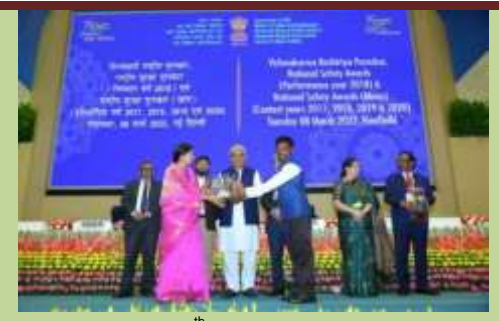
NSA (Mines) function held on 08<sup>th</sup> March 2022 at Vigyan Bhawan New- Delhi.

The lists of award-winning mines for National Safety Awards (Mines) for the contest years 2021 & 2022 have been finalised and the prize awarding ceremony will be held shortly.